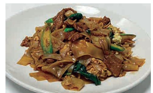
Pad See Ew