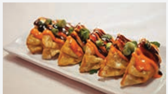
Mayo-Racha Pot Stickers