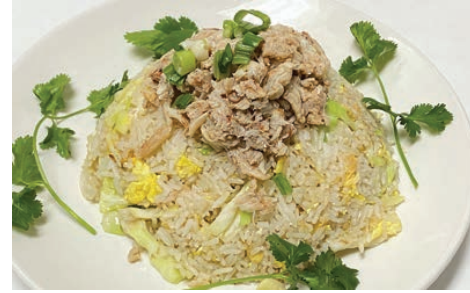
Crab Meat Fried Rice