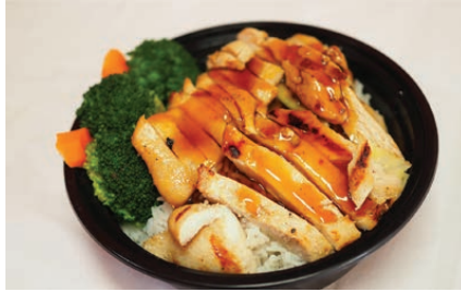
Teriyaki Chicken Bowl

Orange Chicken Bowl Teriyaki Chicken Bowl Sweet Sour Chicken Bowl Pepper Steak Bowl Beef Broccoli Bowl