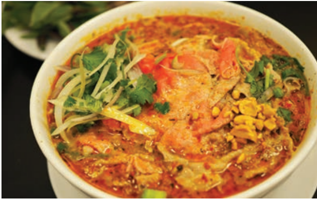
Satay Rare Pho