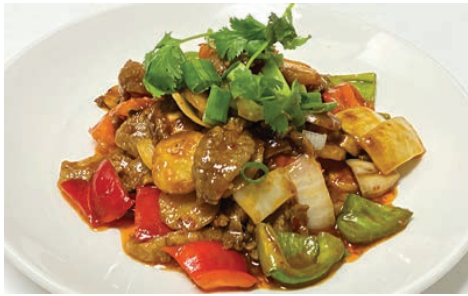
Beef Pepper Steak