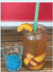
Peach Lychee Green Tea