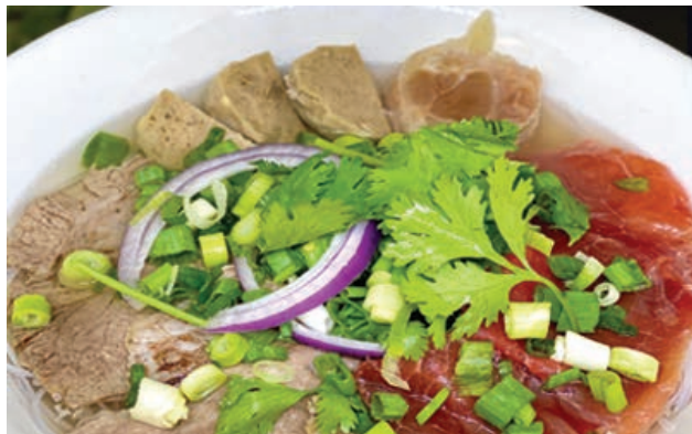
Special Combination Pho

(All include Bean Sprouts, Jalapenos, Basil and Limes)