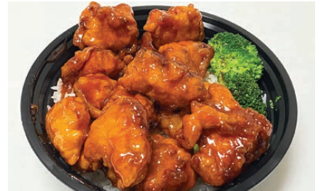
Orange Chicken Bowl