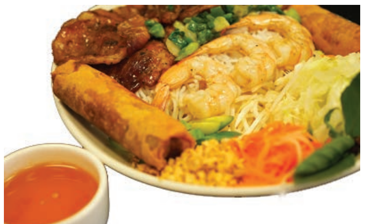
Special Combination Vermicelli