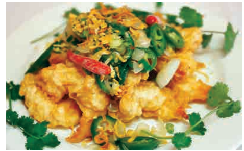
Salt & Pepper Shrimp

Squid, fish ball, shrimp, with assorted veggies in garlic sauce