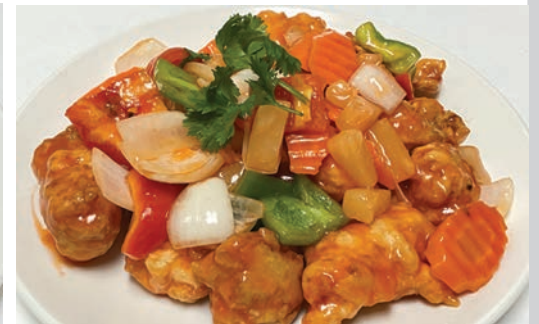
Sweet Sour Chicken