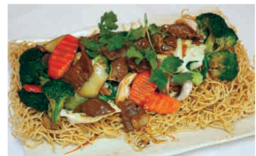
Hong Kong Pan Fried Noodle