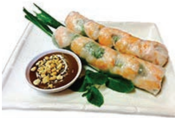
Shrimp Spring Rolls