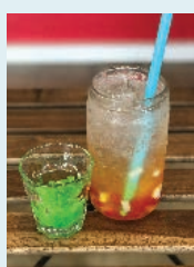
QQ Passion Fruit Green Tea