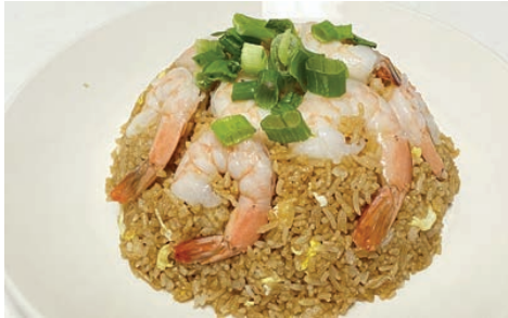
Shrimp Fried Rice