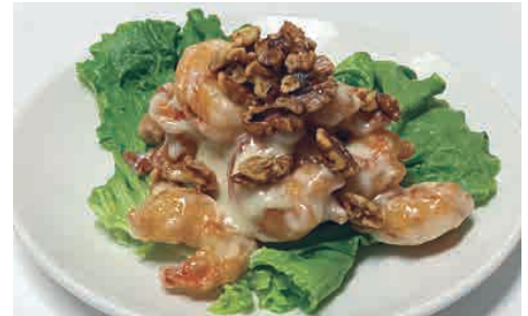
Creamy Walnut Shrimp