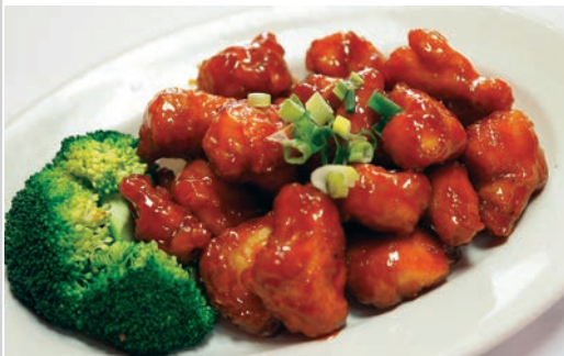
General Tsao's Chicken