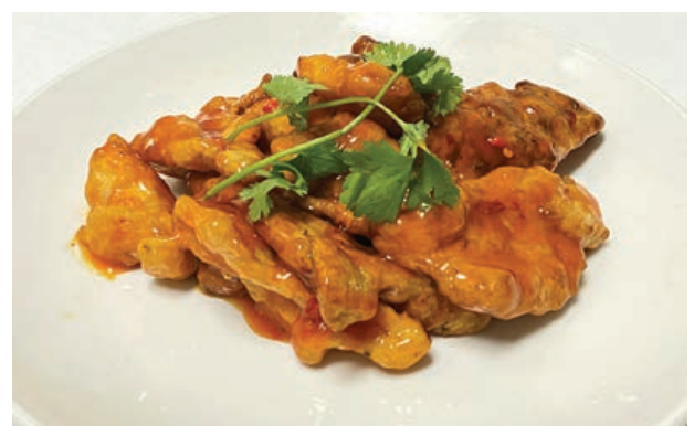
Sweet & Spicy Pork Loin