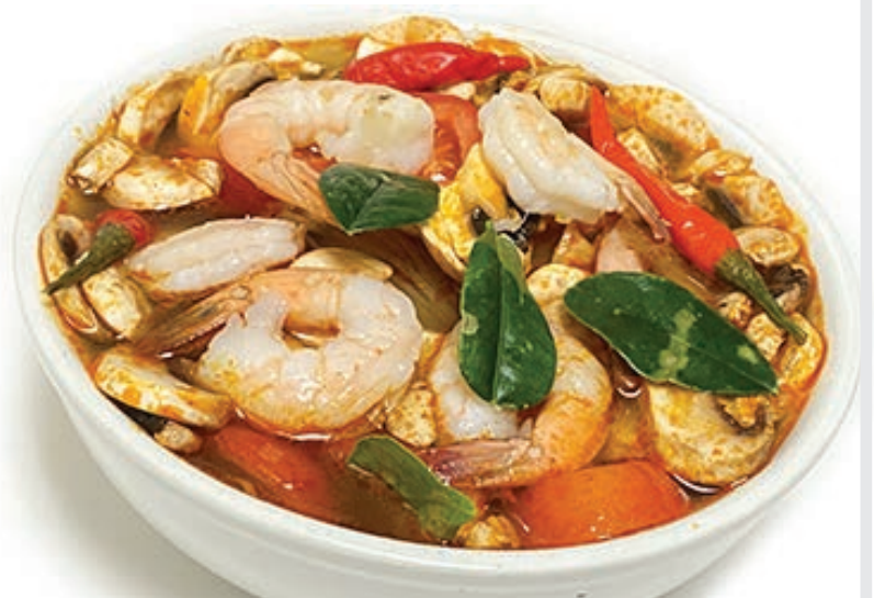
Tom Yum Soup

Tom Ka 🌶️ Chicken $12.95 Shrimp $14.95 Seafood $16.95 Lemongrass, mushroom, lime juice, coconut cream, lime leaves & chili